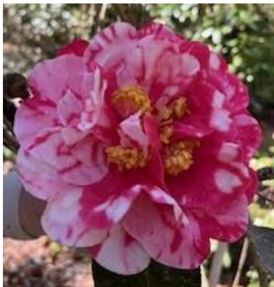
Dixie Knight variegated