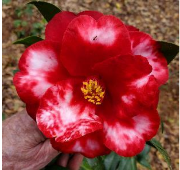
Royal Velvet, Variegated