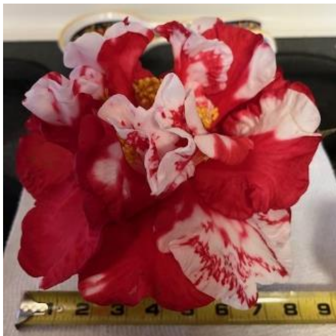
Big Apple variegated