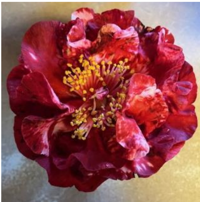
Lady Ruth Ritter variegated