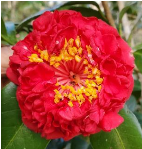
Blaze of Glory