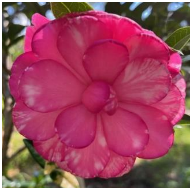
Debbie Ellis var.

Camellia season is upon us. Bountiful rain has given us many large buds to disbud. In doing so it gives you larger blooms. Late season fertilization with 16-4-8, CyberCoat slow release or Milorganite will provide nutritional needs throughout the blooming season.