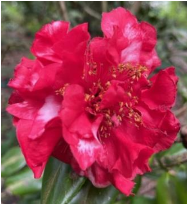
Edna Bass variegated