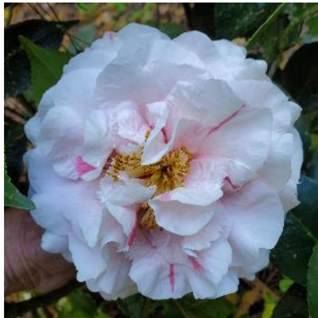
In the Pink variegated