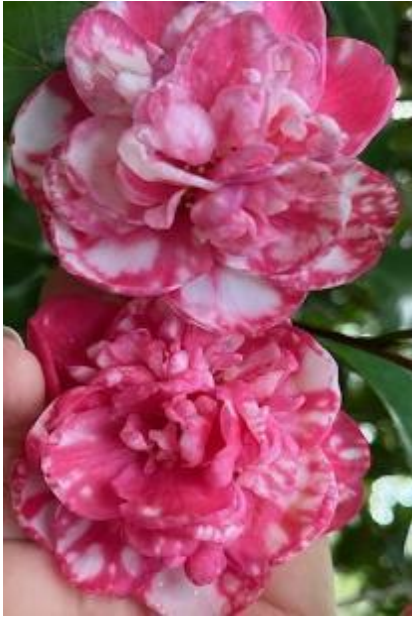
KiKi Tojo var.