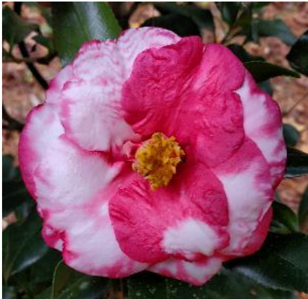
Fred Sander, Variegated

Those nasty bugs were introduced into Florida in 1930 from South America. Due to a lack of natural predators and infectious micro-flora and fungi, these ants have multiplied voraciously and there are now approximately 5 TONS of fire ants per square mile in Florida!