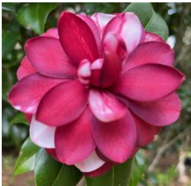
Tudor Baby var.

Camellia season is rapidly descending upon us, with Georgia National Fair on Saturday, October 15 th , followed by the Wiregrass Show in Boston, Georgia, on November 4 th . They are both an easy two hours away if you wish to attend.