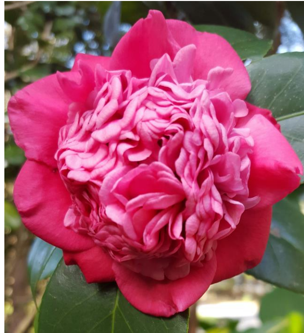
Prof. Charles S. Sargent

A motion was made and passed to accept the December minutes and Treasurer's report.