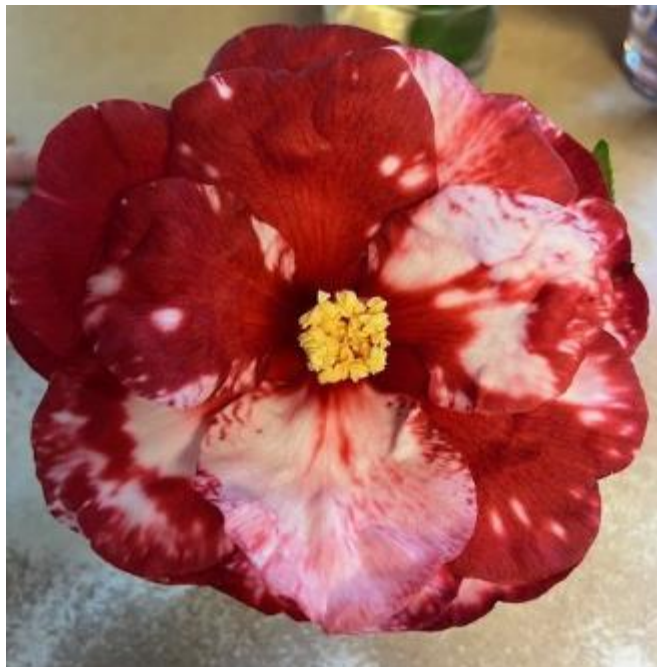
Royal Velvet variegated